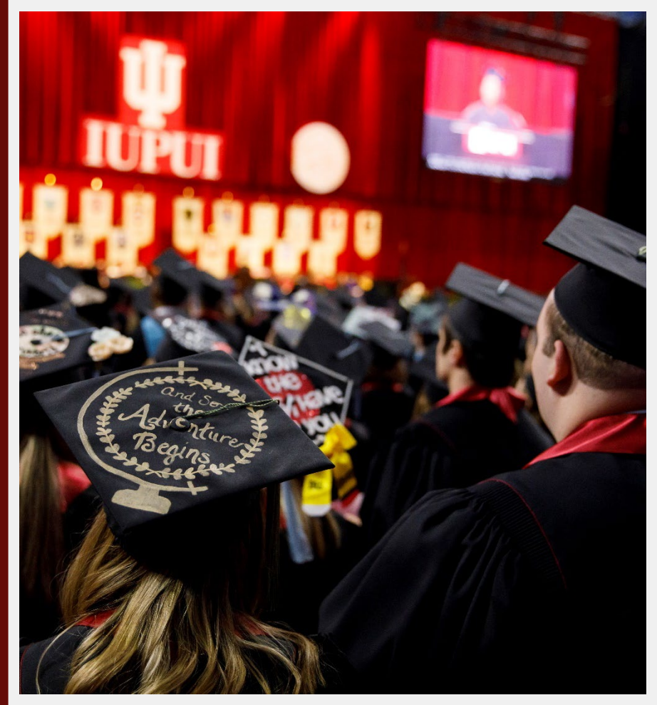
2019 IUPUI Commencement